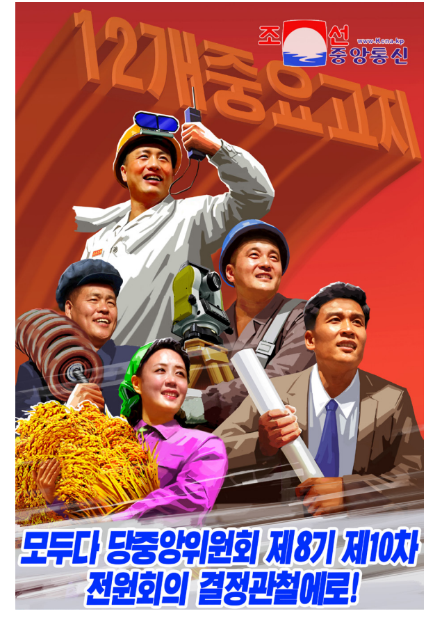
Poster "All out for the implementation of the decisions made at the 10th Plenary Meeting of the Eighth Central Committee of the Workers' Party of Korea!"

The newly created posters will further promote the fighting spirit of all the people full of burning enthusiasm to carry forward the history of the development of the DPRK forever as that of dignity, glory and prosperity with firm confidence in their cause and strength, closely united behind the Party Central Committee.