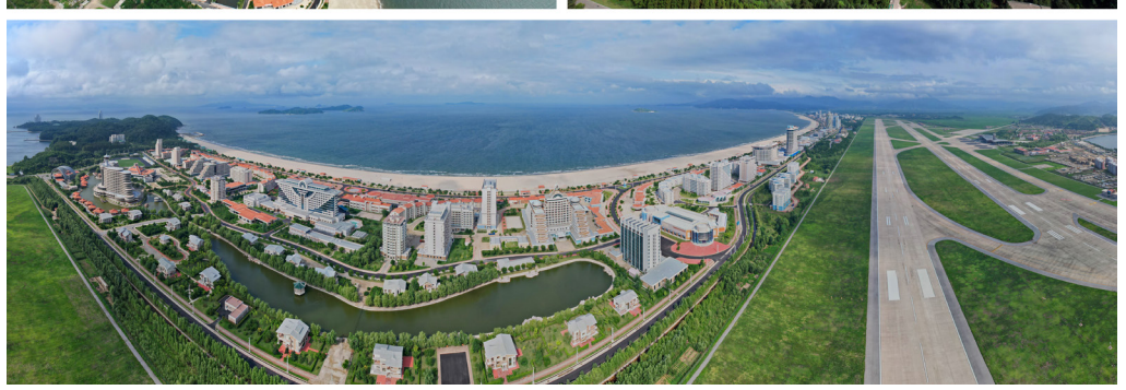
FROM PAGE 1