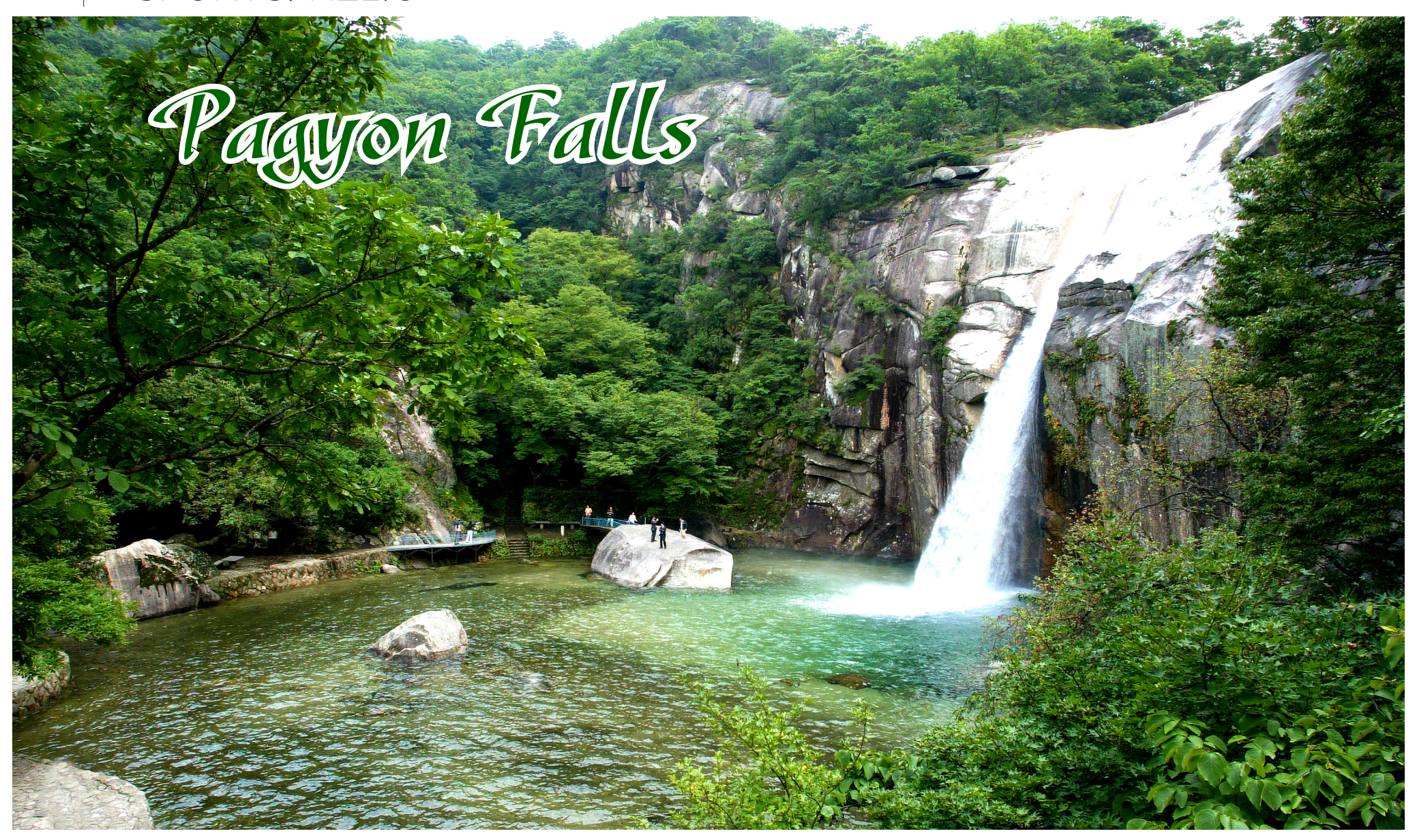
Pagyon Falls, one of the three famous falls in Korea, are located in Pagyon-ri, Kaesong City.